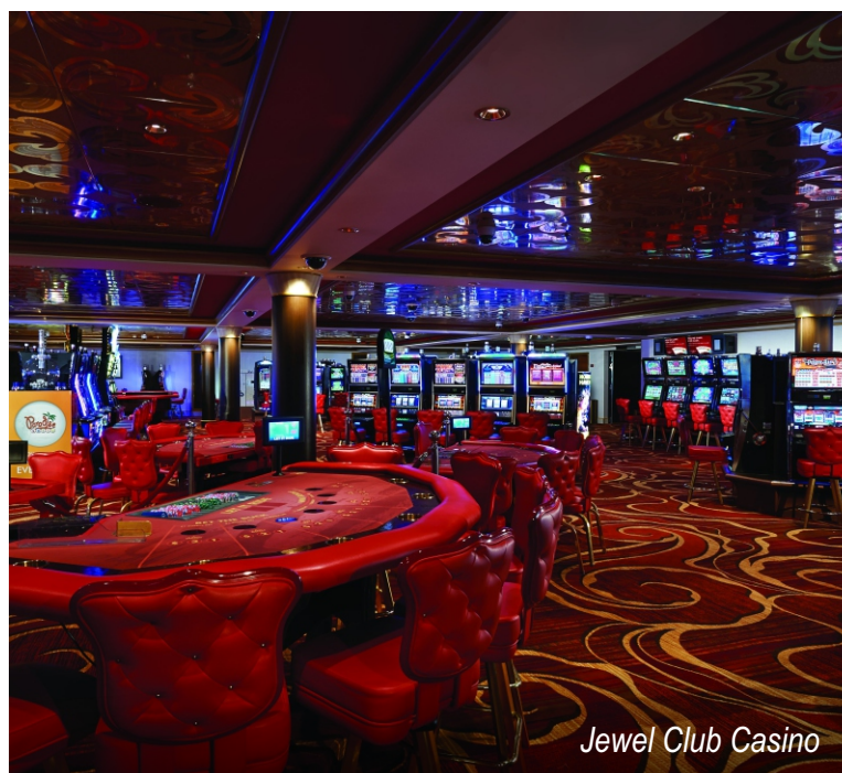
Jewel Club Casino

The Icy Strait Point experience combines authentic regional culture with incredible natural beauty. While in port, optional excursions include enjoying Tlingit dancing and art or getting closer than one could ever imagine to humpback whales and brown bears in the wild. Choose to work up a wilderness hunger and satisfy it with fresh Dungeness crab, or take a cruise from Icy Strait Point and enjoy Alaska's awe-inspiring scenery.